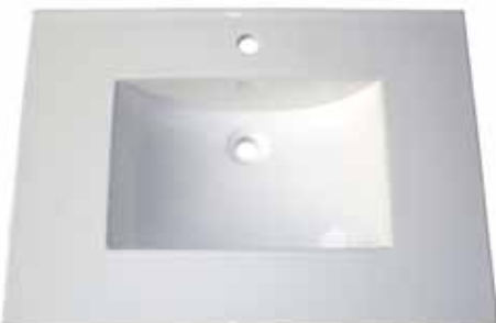
Ceramic top White, single hole 25", 31", 37", 49"