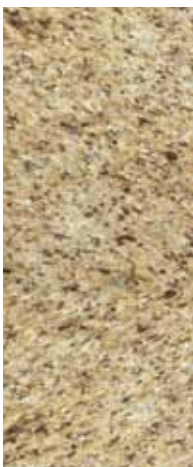
Giallo Ornamental (GO) Granite top