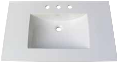
Ceramic top White (or Biscuit), 8" spread 25", 31", 37", 49"