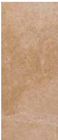
Emperador Lite (EL) Marble top