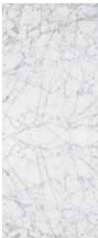
White Carrera (WC) Marble top

Sink Cut-out Dimension: 16 x 13.5" (to fit oval under counter lavatory basin dimensions 17 x 14"). Also available limited sizes of rectangular cut-out to fit 18 x 12" undermount basin. 8" Widespread Faucet Pre-drilled, Back Splash Included, Side Splash NOT available. Granite & Marble is a Natural Stone, WE CAN NOT Guarantee an exact Shading or Grain. All Granite or Marble Tops Are Pre-Sealed At Factory. Each Piece has been REINFORCED in Packaging and are Packaged Individually. A TEAM EFFORT should be USED when INSTALLING.