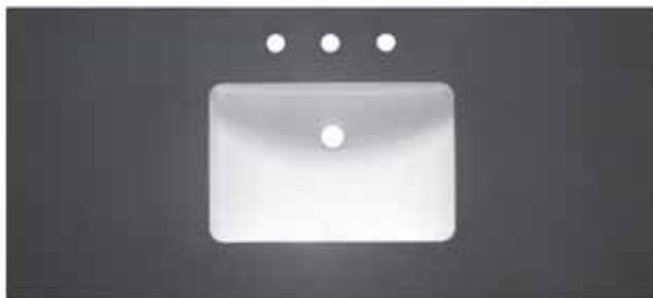
Quartz Top Deep Gray (GR) 24", 30", 36", 48", 60" (double bowl)