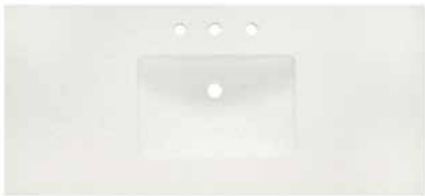
Quartz Top Eggshell (EG) 24", 30", 36", 48", 60" (double bowl)